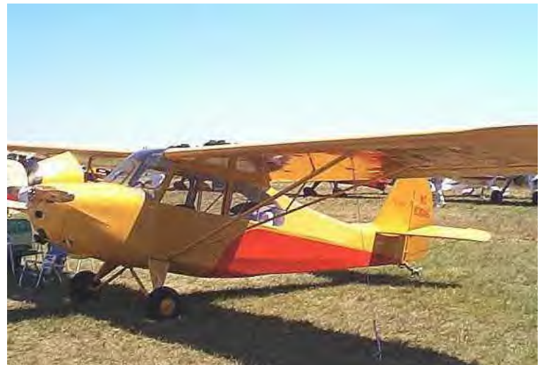
Full Scale Aeronca Champ

Bob Burt brought his new project a 140" Aeronca Champ to the December meeting. This project features built up ribs as shown in the photo and will fly on a Quadra 50. Bob's wood working and building skills are absolutely second to none.